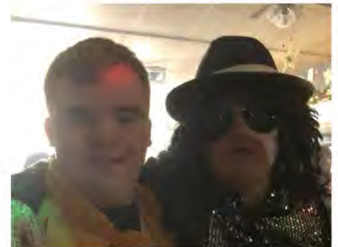
Conwy Connect Disco

Front cover is from Dance and Movement session at our MOS social night