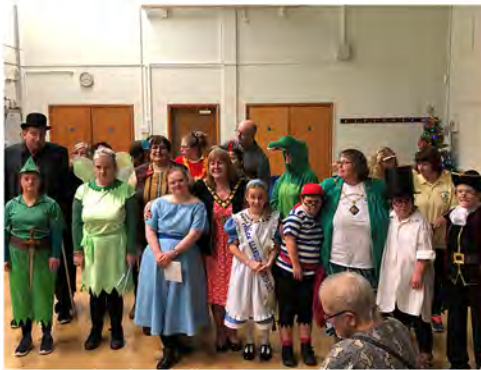
Venture Drama Group