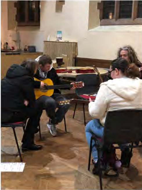
Conwy Guitar Session

Hello and welcome to the fourth edition of our What Matters Magazine. You will find lots of information and photos. We will shine a spotlight on some of our members and what matters to them.