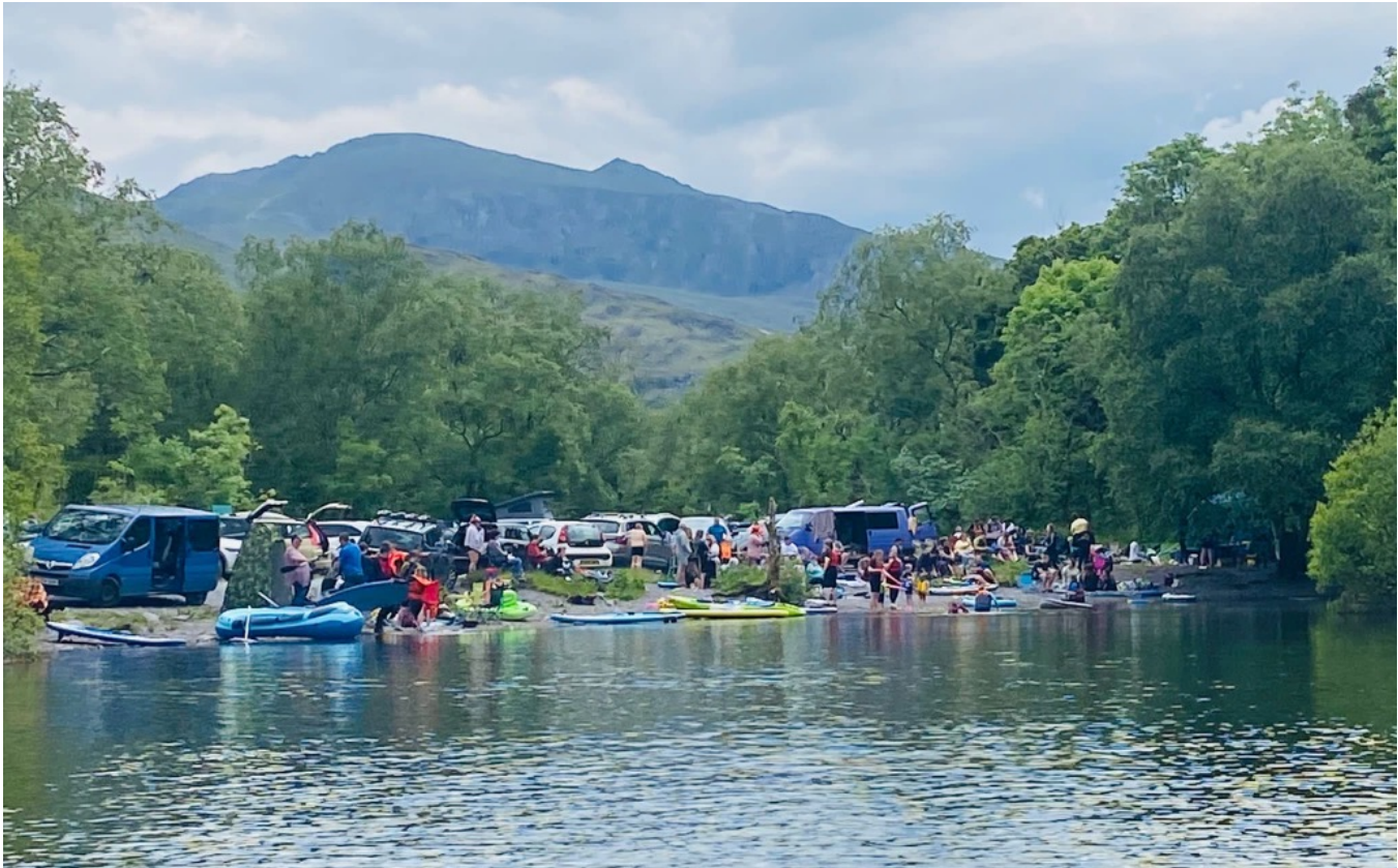
Photo was taken on our big day out paddleboarding to Llyn Padarn summer 2022

Mission statement: At Conwy Connect for Learning Disabilities, our mission is to promote and protect the rights of people with learning disabilities living within North Wales. We strive to empower people with learning disabilities by ensuring they have equality of choice and opportunity in their communities. We aim to achieve this through providing high-quality support, self-advocacy, and promoting community integration.